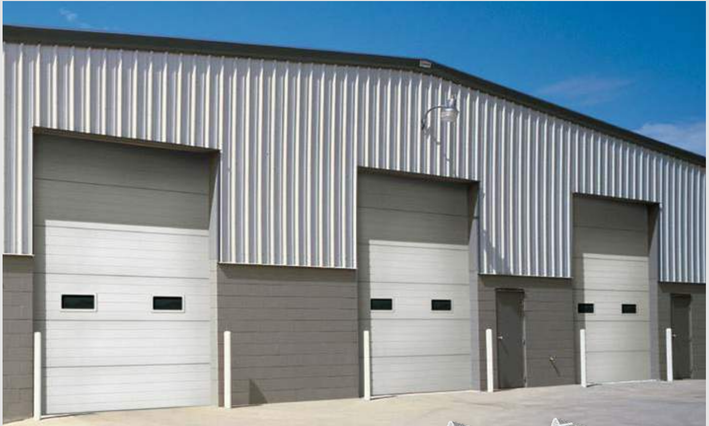
Model 520, 12'2" x 16' doors, shown with 24" x 6" Lites