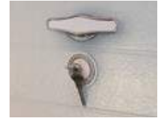
Outside keyed lock